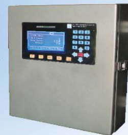
Gravity Type Metal Detector