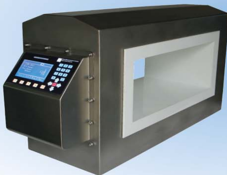
Horizontal Type Metal Detector

* Specifications are subject to change without prior notice